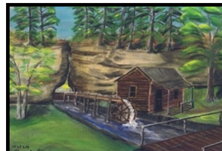
The Lost Mill