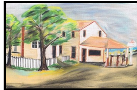
Rinehart's first store at Rockbridge