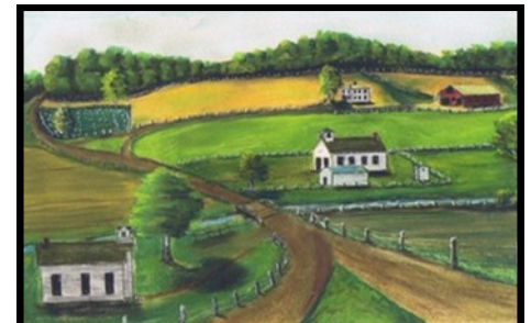
Bloom City Church and Cemetery