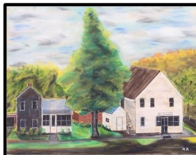
T J Truesdale Store