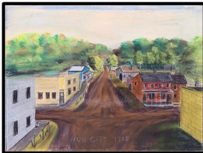
Hub City 1918